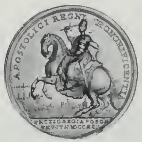
Lot No. 3203